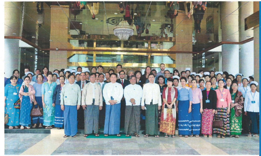
Participants of the FP Best Practices Conference gather together on June 30, 2014, PHOTO: U Thaw Zin